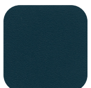
X08 - BLUE