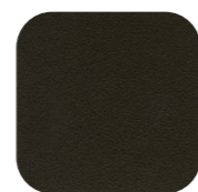
X15 - BROWN