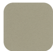
X09 - SAND