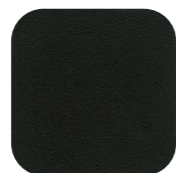
X07 - BLACK