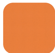
X04 - ORANGE