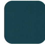
X23 - PETROL