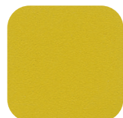
X10 - YELLOW