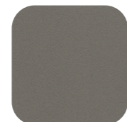
X16 - MUD