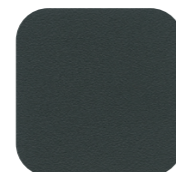
X03 - DARK GREY