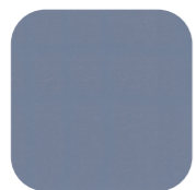
X19 - PIGEON BLUE