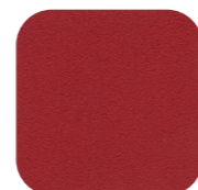
X05 - RED