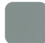
X02 - LIGHT GREY